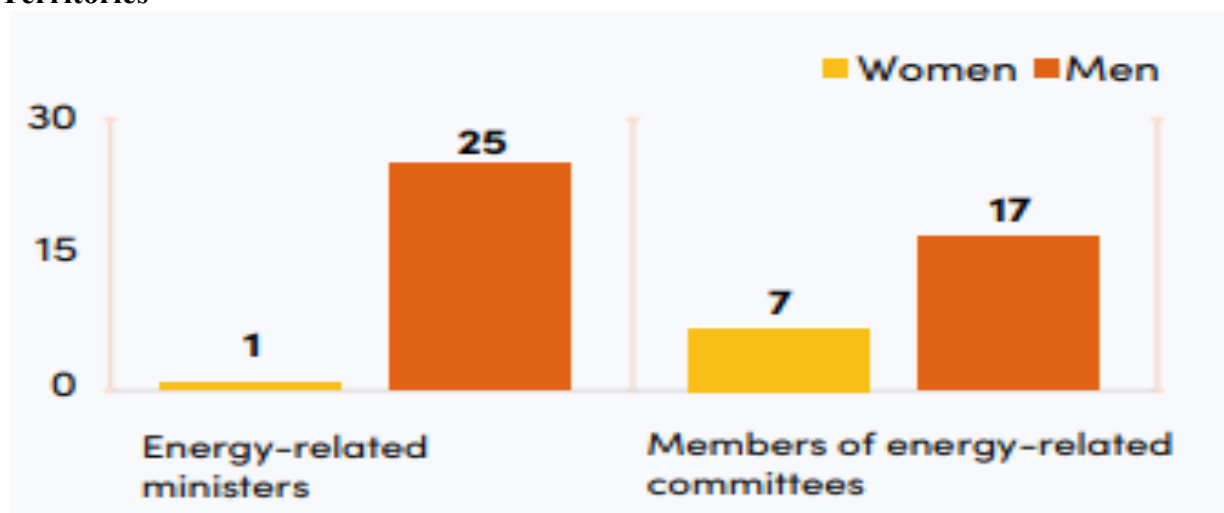
Figure 3: Number of People Serving as Energy-Related Ministers and on Energy-related Parliamentary Committees, by Sex (as of August 2021), in the Pacific Island Countries and Territories

(Source: United Nations Women. Gender Equality and Sustainable Energy: Lessons from Pacific Island Countries and Territories , 2021, https://data.unwomen.org/sites/default/files/documents/Publications/Gender_Equality_and_Sustainable_Energy_Pacific.pdf .)